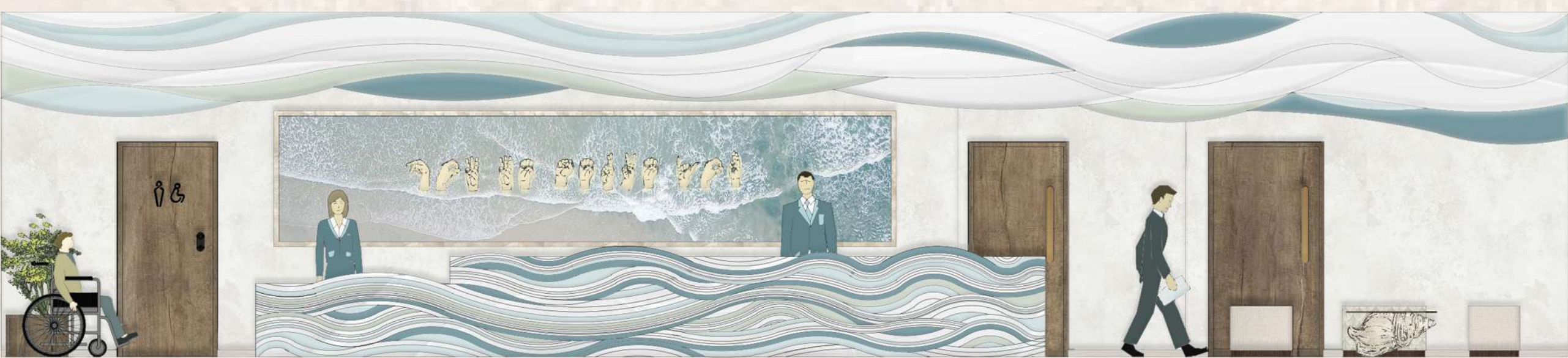
INTERIOR ELEVATION SCALE 1: 50