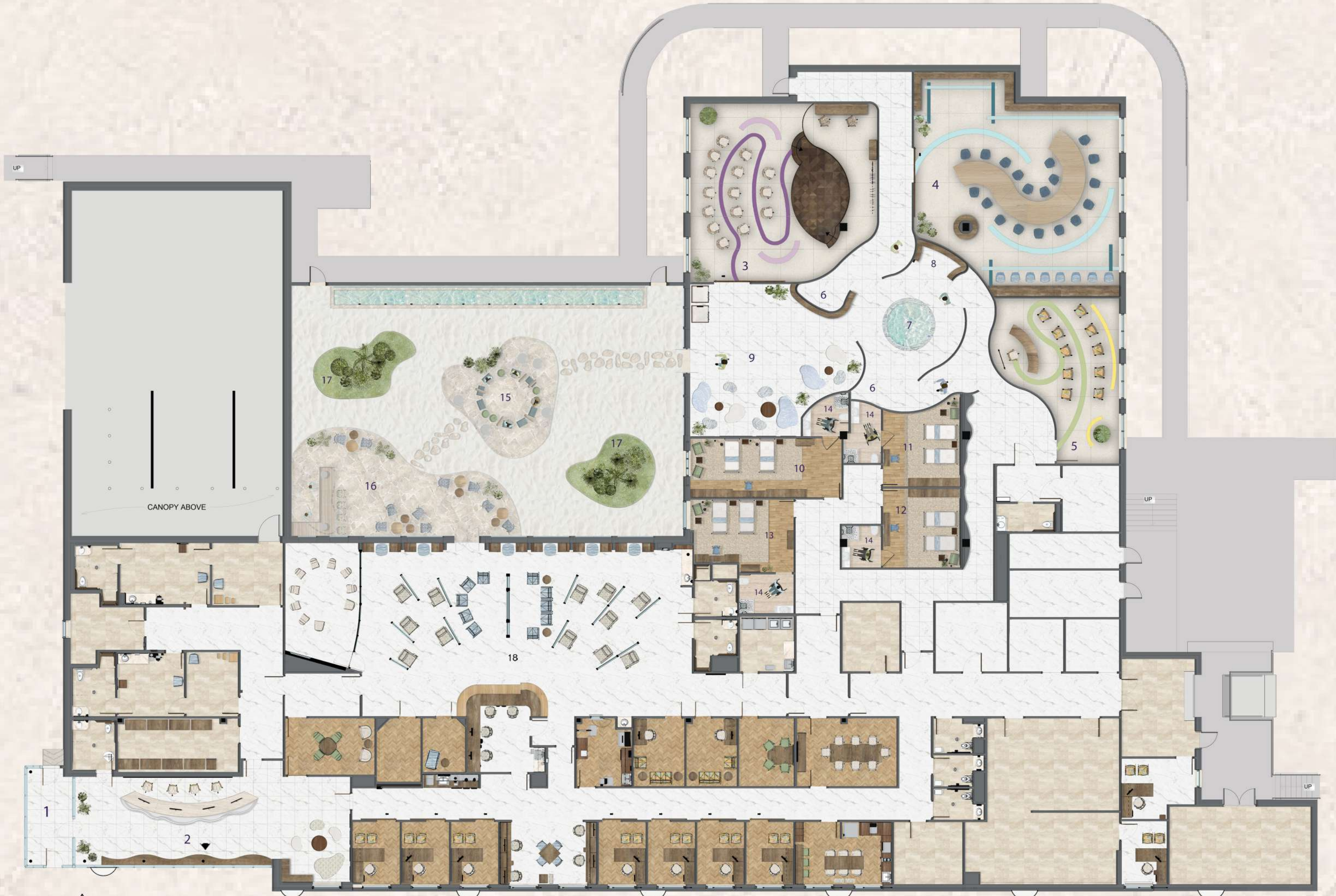
Furniture plan SCALE 1: 150